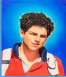
St. Carlo Acutis Pericardium Relic